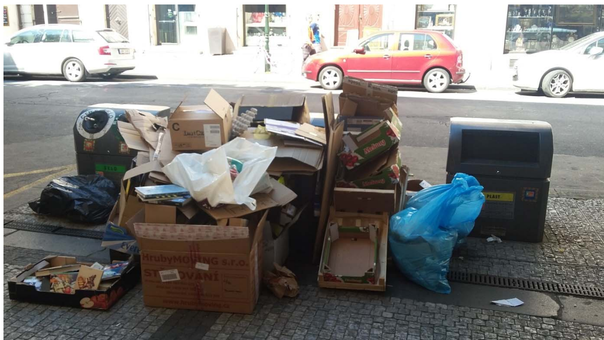
Figure 2: The state of underground container stations in Prague 1

Unfortunately these stations are very frequently utilised – particularly in the central parts of Prague – by bars and restaurants to dispose of their waste. As a result, this waste too is cleaned up at the city's expense (see Figure 2). The use of public collection receptacles by businesses is therefore currently prohibited, with public receptacles primarily intended for ordinary citizens to dispose of their waste.