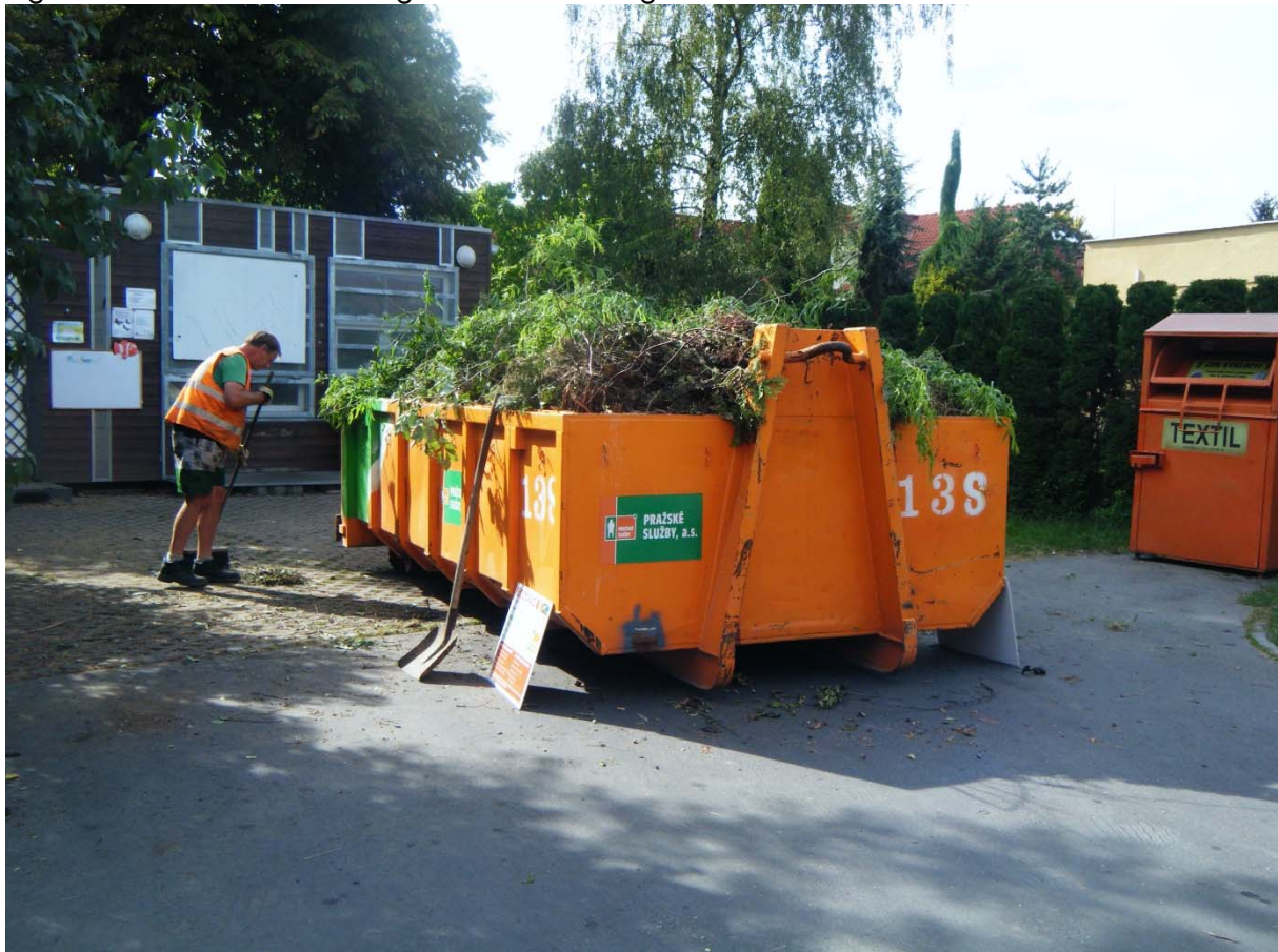
Figure 5: Bulk container for organic waste in Prague - Dubeč

Schedules and locations for bulk containers can also be found on the aforementioned environment portal or on the website of the respective Municipal Districts Prague 1 - 57.