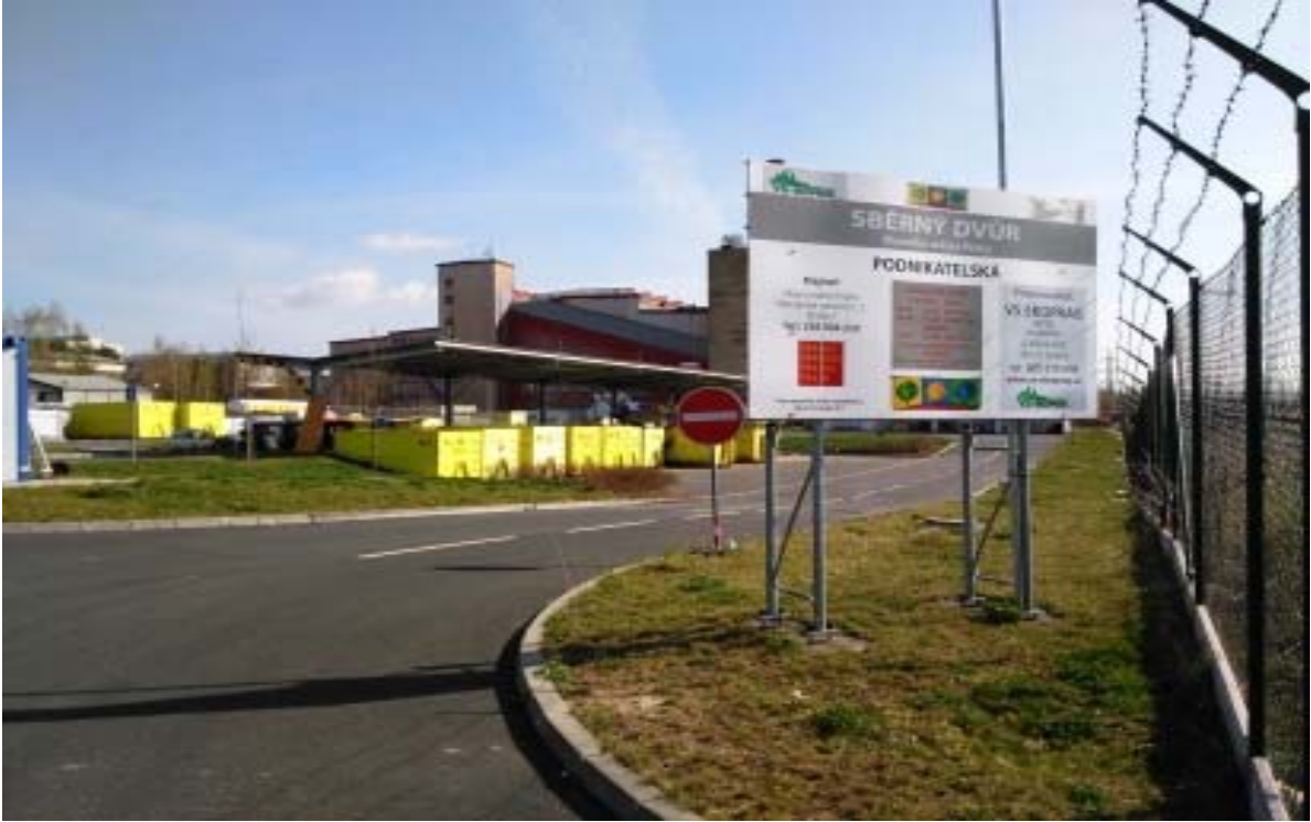
Figure 4: Civic amenity site on the street Zakrytá in Prague 4